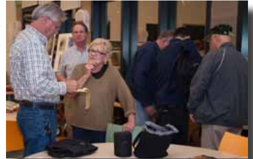
Image Share We love to share our photos.

Negotiations were intense as some members reduced their inventory while others added to their picture taking arsenal. Bags, tripods, filters, books, cameras, and more exchanged hands.